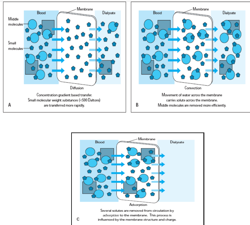
Figure (1): Mechanisms of solutes removal in hemodialysis (William, 1999)

respectively – the membrane surface area (A), the blood and dialysate flow rates. (Ronco and Clark, 2005)